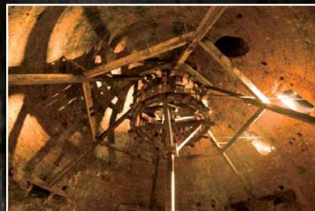
Baritel of San Andrés.