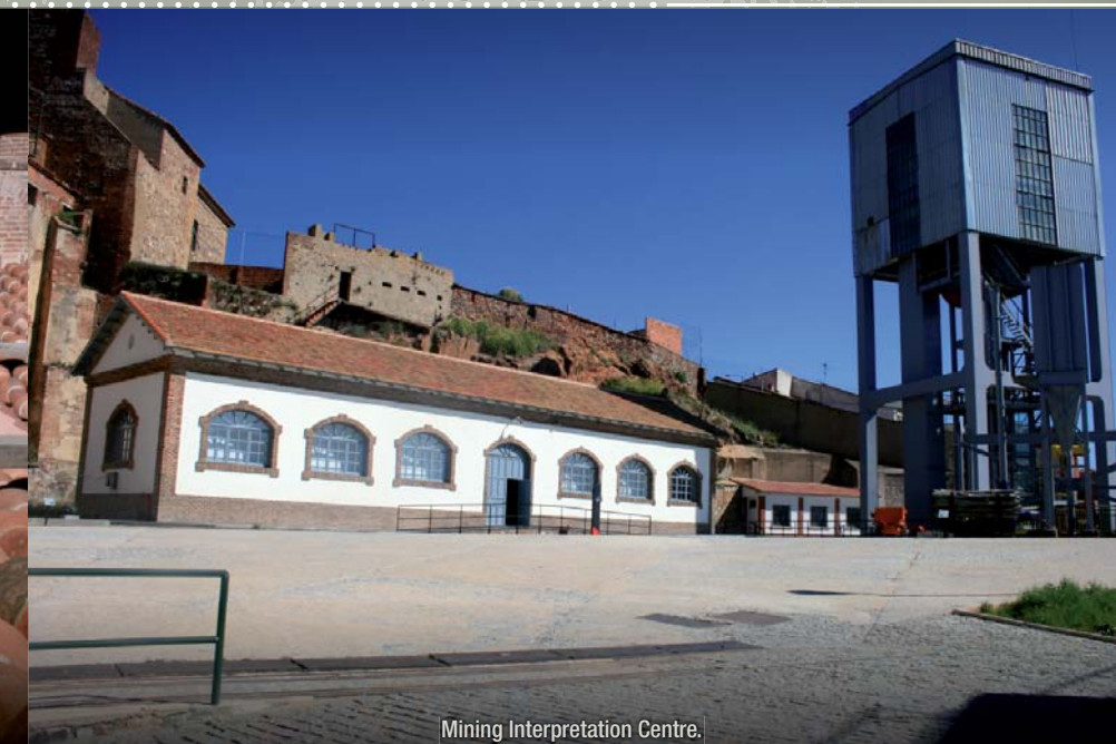
Mining Interpretation Centre.