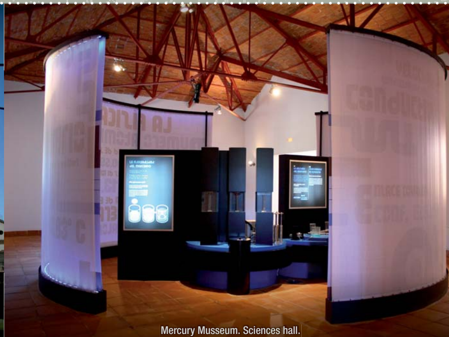
Mercury Museum. Sciences hall.