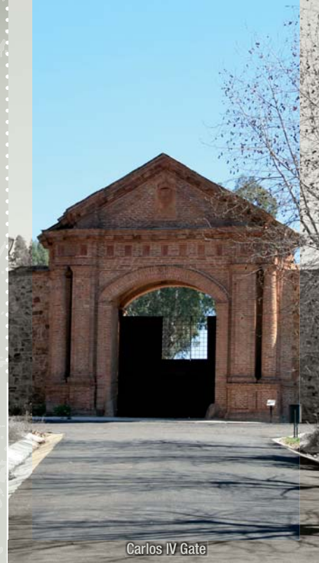
Carlos IV Gate

Mercury, the quicksilver of the Romans, is shown in the Park in all its aspects, the extraction of mineral, cinnabar, mercury sulphide, their transformation in metallurgical furnaces, their physical and chemical properties, their uses, and, of course, its eternal history.