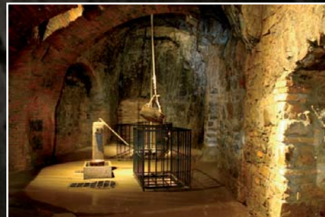
Water pump at San Andrés shaft.