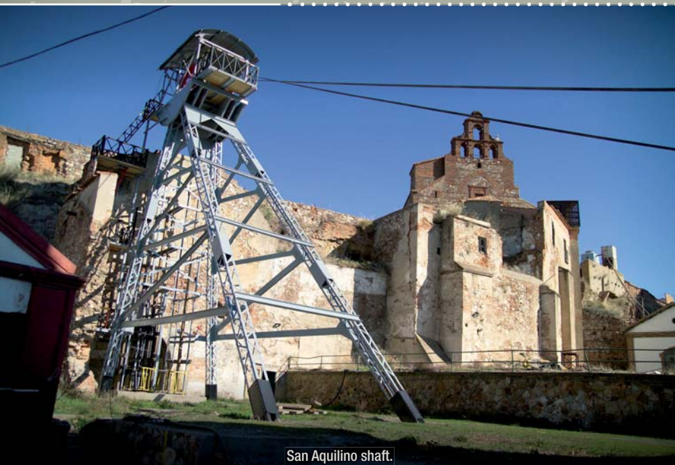
San Aquilino shaft.