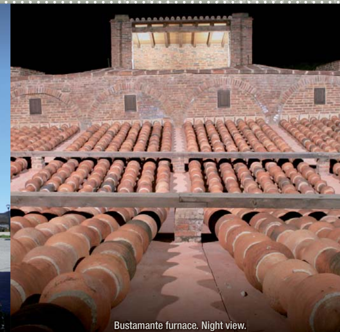
Bustamante furnace. Night view.