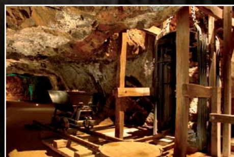
Level 1° landing in the San Aquilino shaft.